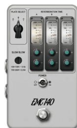
Plate reverb was inspired by EMT 140, which made use of a metal plate suspended in a steel frame, that was able to recreate reverberations similar to those heard in an acoustic space; a renowned studio reverb found on classic recordings.